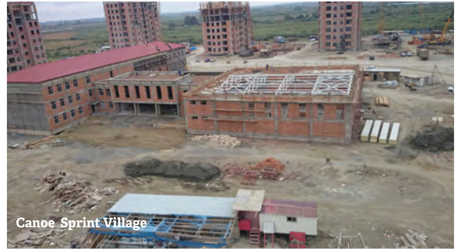
Canoe Sprint Village

The operational dates of the villages can be found in the Key Dates section of this newsletter.